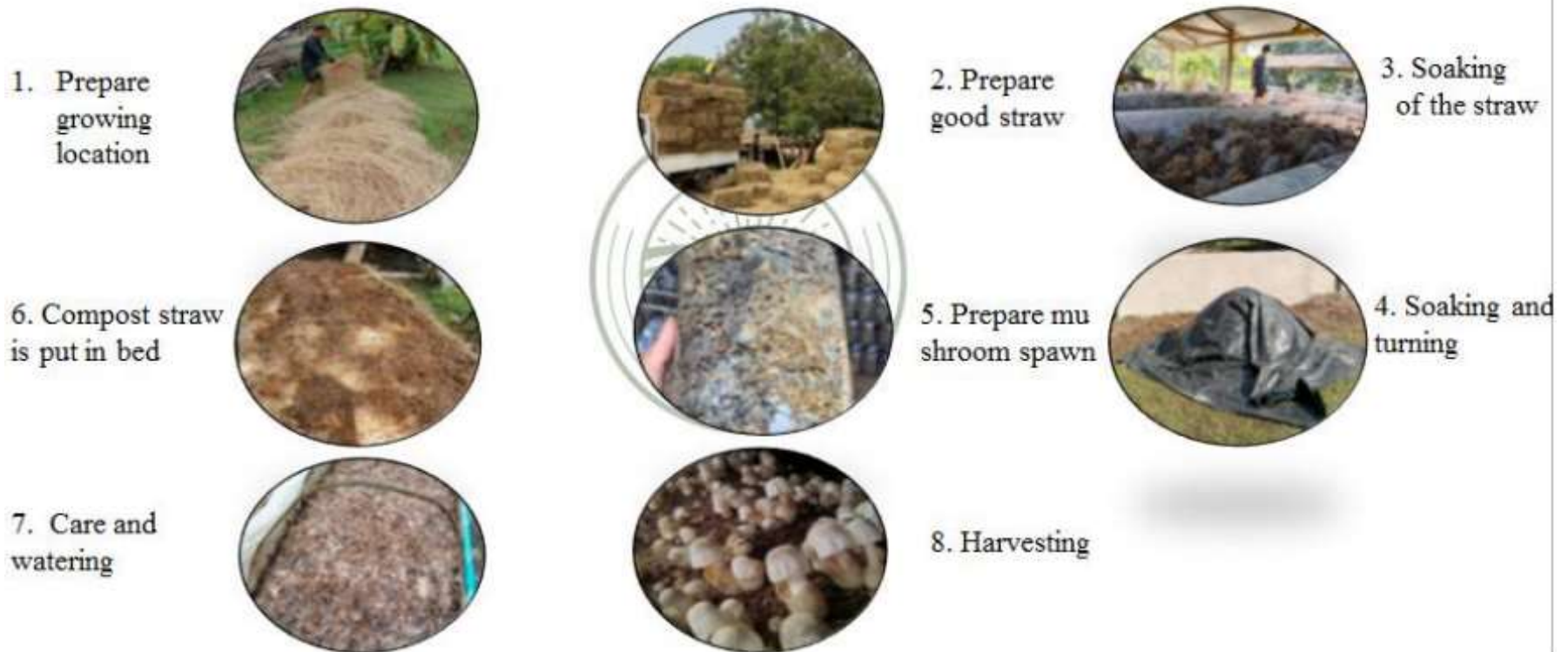
Step of straw management and processing (Outdoor cultivation)