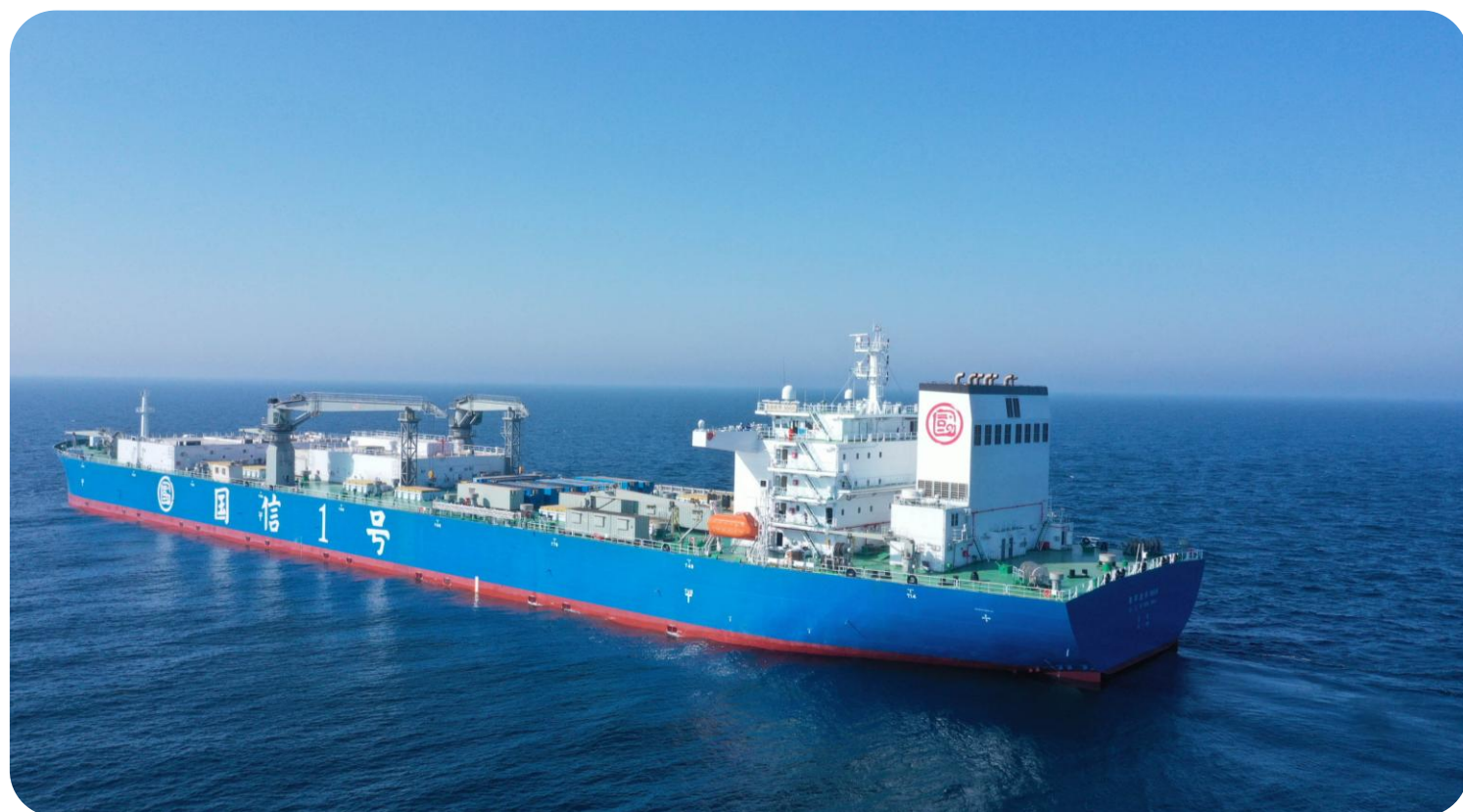
The world's first 150,000-ton smart aquaculture vessel, "Guoxin 1-2-1"