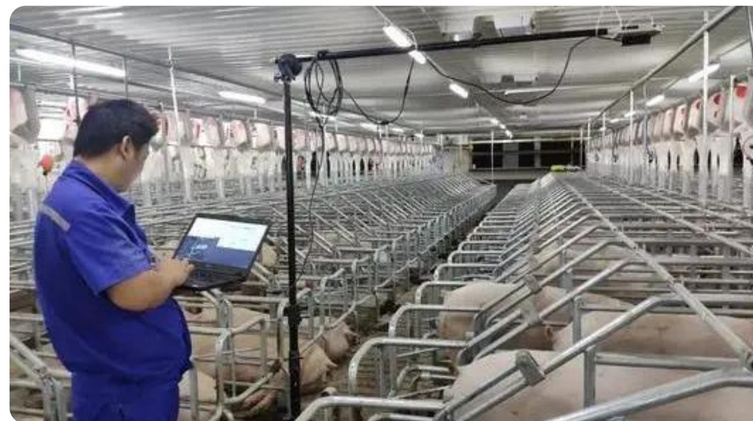
Muyuan Foods · AI-powered smart pig farming system

It is equipped with over 200 cameras and 2,000 sensors, achieving a mechanization rate of over 90%.