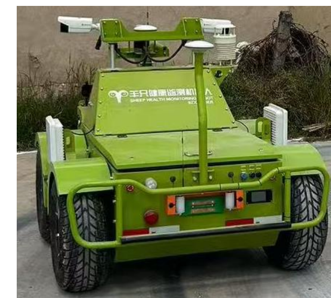
Sheep Monitoring Robot