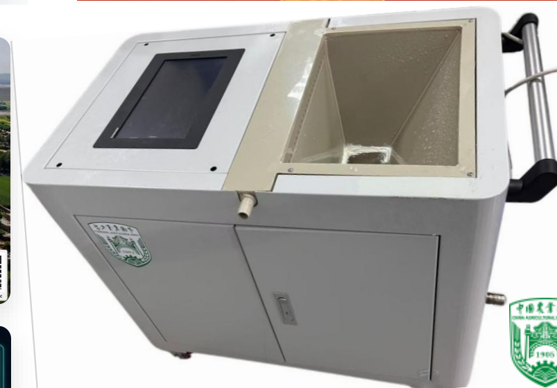
Lightweight Fry Counter