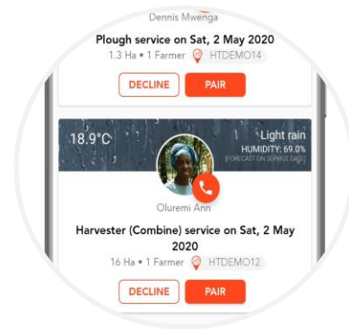
Bundle Ag services