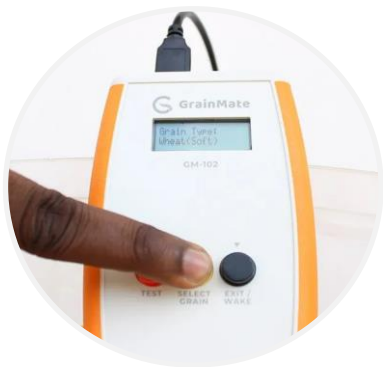
Design for women-users

How can we ensure that women farmer's benefit from the digital revolution agriculture?