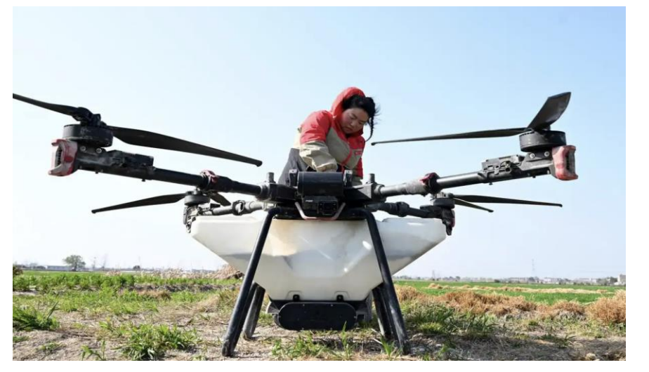
Xu Juan, a female drone operator, can complete pesticide spraying or fertilizer 33 hectares farmland in a day.