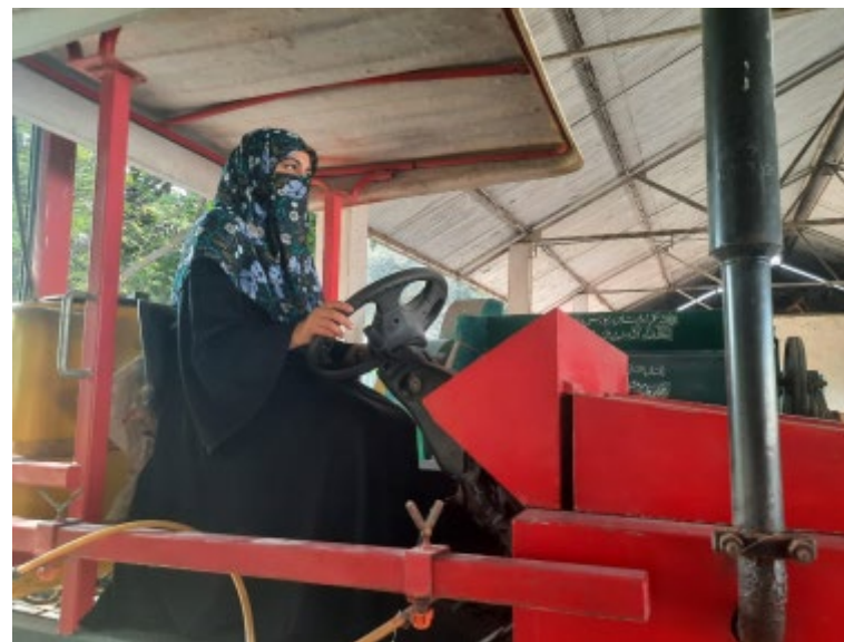
Agriculture Engineers from University of Agriculture Faisalabad