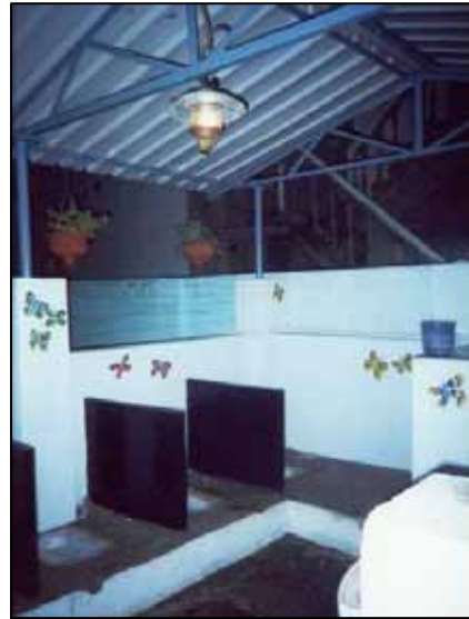
Figure 5 Biogas to light Biolamp in a children's toilet