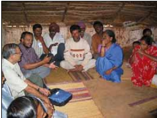
Figure 3 Capacity building interventions with communities

In India, cultural stigmas surrounding human waste add to the myriad challenges to the sustainability of any community sanitation development project. Accordingly, a significant part of the project is social measures such as hygiene interventions, informed choice options, education, awareness, capacity building and sensitization activities. The willingness to accept treatment and resource recovery approaches therefore increases the demand for wastewater treatment strategy and its sustainability, sound strategies that can ensure their sustainability.