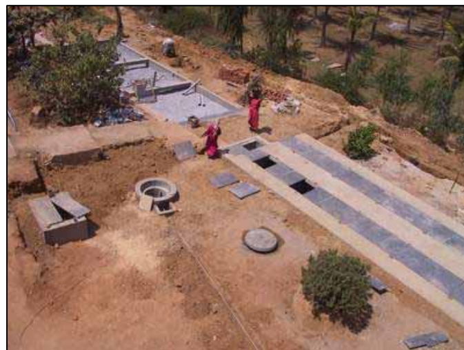
Figure 2 DEWATS with Biogas digester at Friends of Camphill