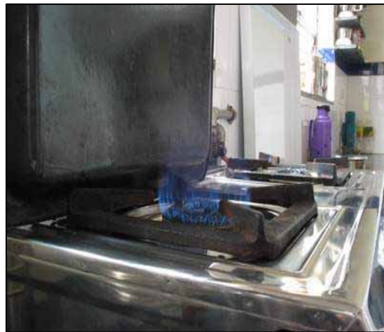
Figure 6 Biogas as cooking fuel

The experience and learning of all community based sanitation projects linked with biogas or reuse of resources has been that initially there is outright rejection (based on the described cultural stigma and ignorance). After exposure visits to systems in operation turns the rejection in to acceptance, more demand for such units and then even a sense of ownership. This shows that technology can overcome these stigmas. Some limitations that community based sanitation