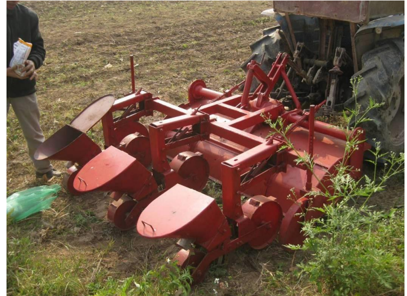
Conservation tillage (Direct seeder)