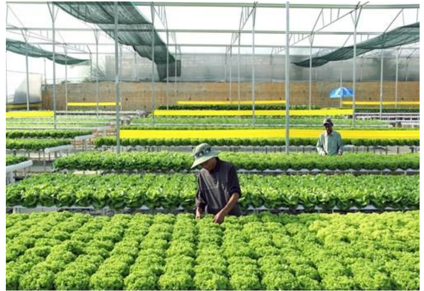
Some Photos of modern open-meshed houses