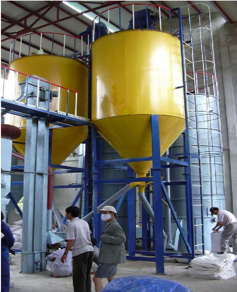
Rice (maize) Dry 10 tan/time