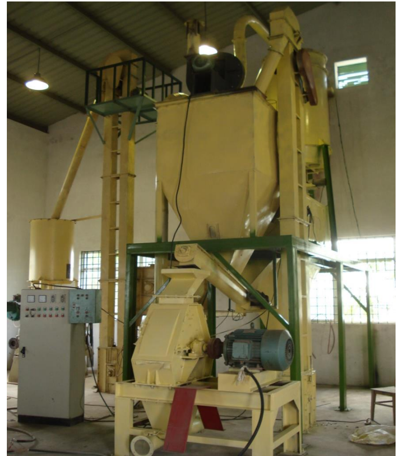
Food processing machine for fish