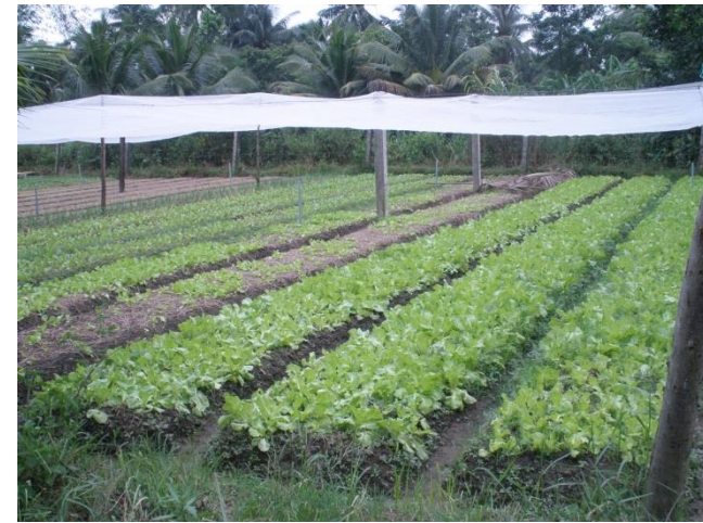
Some Photos of simple open-meshed houses