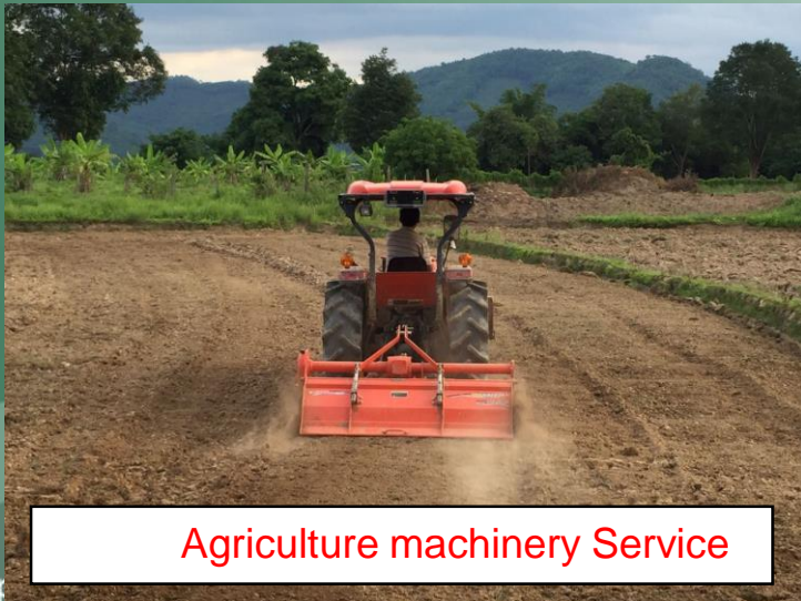
Agriculture machinery Service