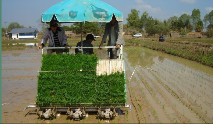
Agriculture demonstration and knowledge sharing