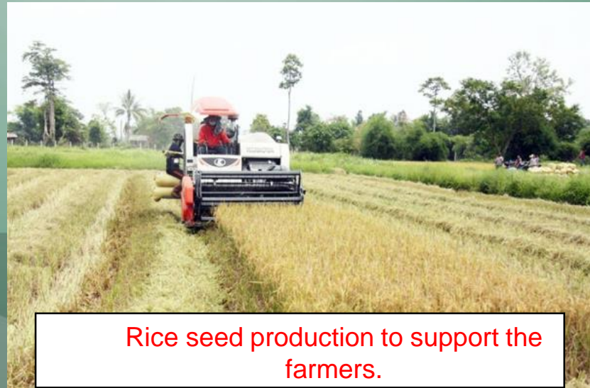
Rice seed production to support the farmers.